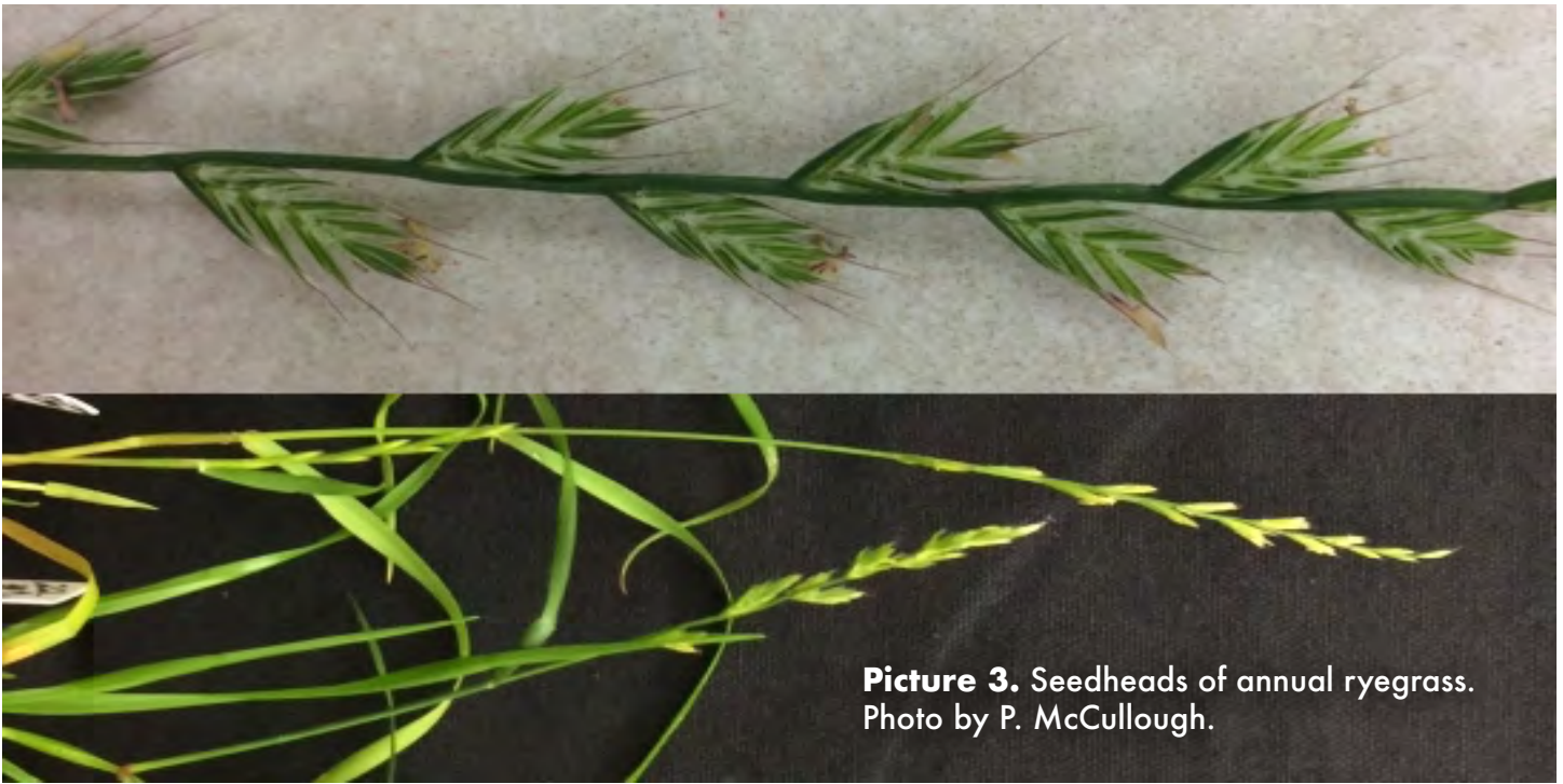
Picture 3. Seedheads of annual ryegrass.

Annual ryegrass is a prolific seed producer that contributes to annual infestations. The seedhead is a long spike with at least 10 alternating florets (Picture 3). The florets contain long awns (hair- or bristle-like parts) that are not present on perennial ryegrass ( Lolium perenne ). Plants typically produce seedheads in March in most parts of Georgia. Seed dispersed in late spring can remain dormant in the soil for years. Another key characteristic to help identify annual ryegrass, without seedheads, is the clasping auricles (structures that project from either side of the leaf collar) at the junction of the leaf sheath and blade (Picture 4). The auricle may help growers identify annual ryegrass from other weedy grasses, such as tall fescue.