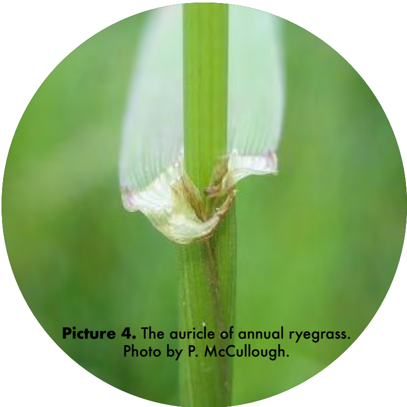
Picture 4. The auricle of annual ryegrass.

Annual ryegrass is a prolific seed producer that contributes to annual infestations. The seedhead is a long spike with at least 10 alternating florets (Picture 3). The florets contain long awns (hair- or bristle-like parts) that are not present on perennial ryegrass ( Lolium perenne ). Plants typically produce seedheads in March in most parts of Georgia. Seed dispersed in late spring can remain dormant in the soil for years. Another key characteristic to help identify annual ryegrass, without seedheads, is the clasping auricles (structures that project from either side of the leaf collar) at the junction of the leaf sheath and blade (Picture 4). The auricle may help growers identify annual ryegrass from other weedy grasses, such as tall fescue.