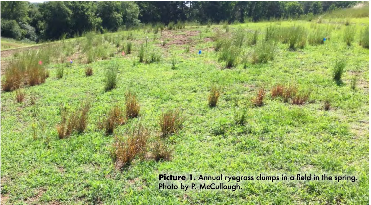
Picture 1. Annual ryegrass clumps in a field in the spring.

Annual ryegrass ( Lolium multiflorum ), also referred to as Italian ryegrass, is the most problematic winter annual weed in Georgia hayfields. Seed germinates from September to November when soil temperatures drop below 70 degrees F. Seedlings mature in the fall, overwinter in a vegetative state, and resume active growth in the spring. Annual ryegrass grows well under cool conditions when pasture grasses are dormant or if there is limited competitive growth. Plants exhibit erect growth that reaches approximately 3 feet in height upon maturity (Pictures 1 and 2). As a result, annual ryegrass may interfere with pasture grasses during spring green-up and beyond.